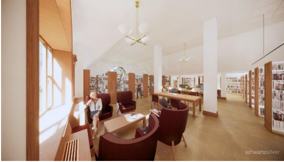
Reading Room – Proposed