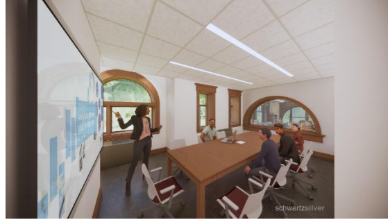
Conference Room – Proposed