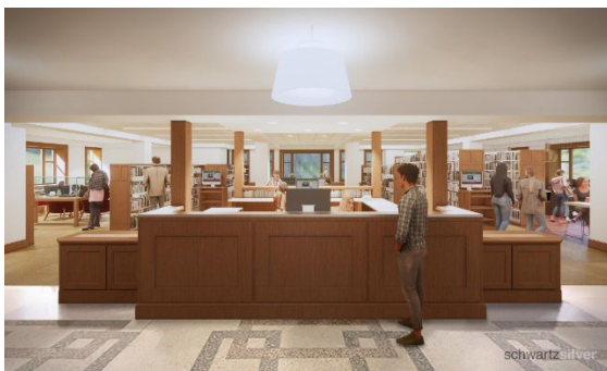
Lobby – Proposed