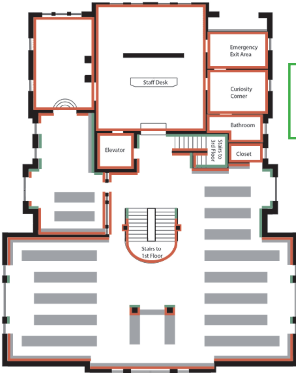
Exhibit Cases: 2nd Floor width x depth x height 36" x 12" x 18" 22" x 80.5" x 20"

Please direct all queries to the Library Curators: